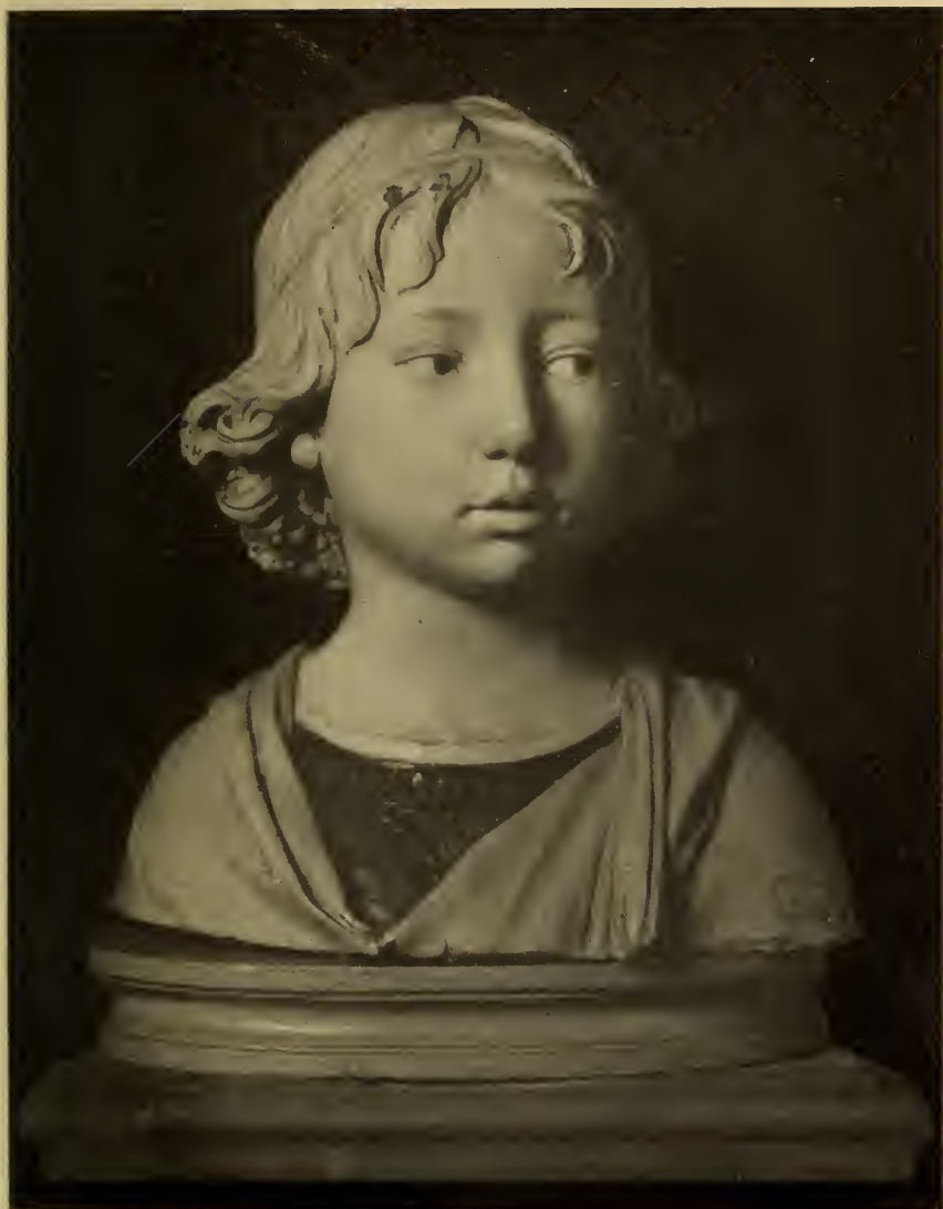
BUST OF A BOY (SOMETIMES CALLED THE BOY CHRIST)

BY LUCA OR ANDREA DELLA ROBBIA IN THE BARGELLO